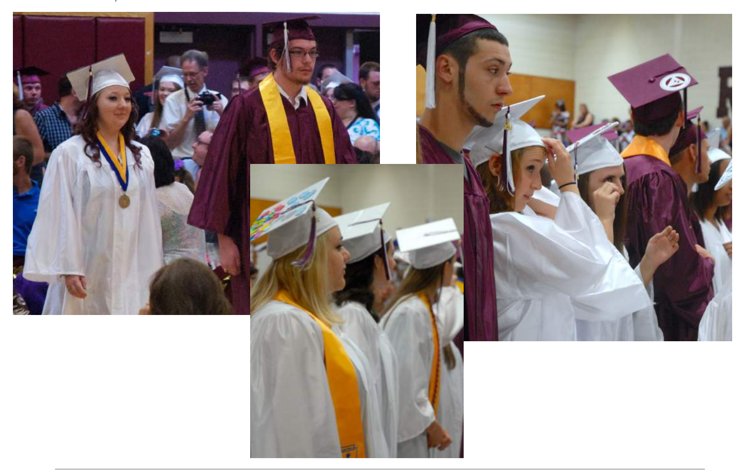
Canastota Central School District 120 Roberts Street Canastota, New York 13032